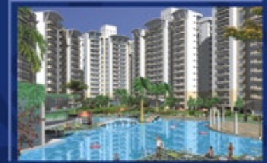
KRISHNA APRA GARDENS Indirapuram, Ghaziabad