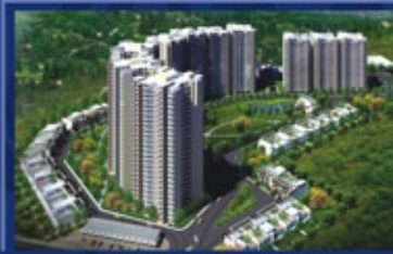
MAPSKO CASABELLA Sector-82, NH-8, Gurgaon