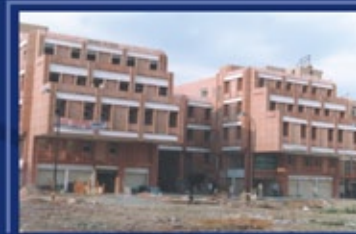
APRA PLAZA Road No. 44, Pitam Pura, New Delhi