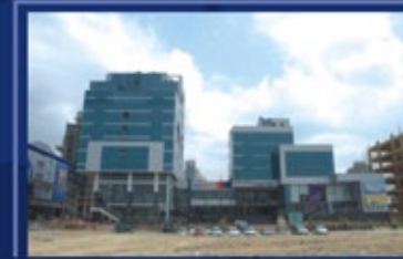
KRISHNA APRA BUSINESS SQUARE Pitam Pura, New Delhi