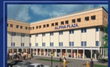
KRISHNA APRA ALPHA PLAZA Greater Noida

Gurgaon Office: GF 004, Time Tower, M.G.Road, Gurgaon: 122002