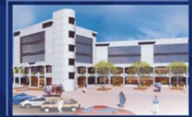
KRISHNA APRA PARK PLAZA Greater Noida