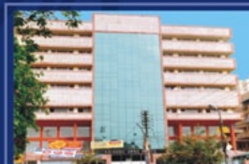
KRISHNA APRA PLAZA Noida