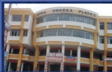
APRA DWARKA PLAZA-I Dwarka, Delhi