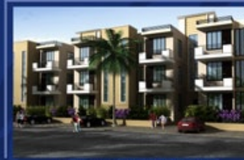
MAPSKO CITY HOMES Sector-27, Sonapat