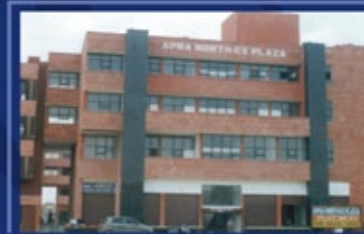
APRA NORTH-EX PLAZA Pitam Pura, New Delhi