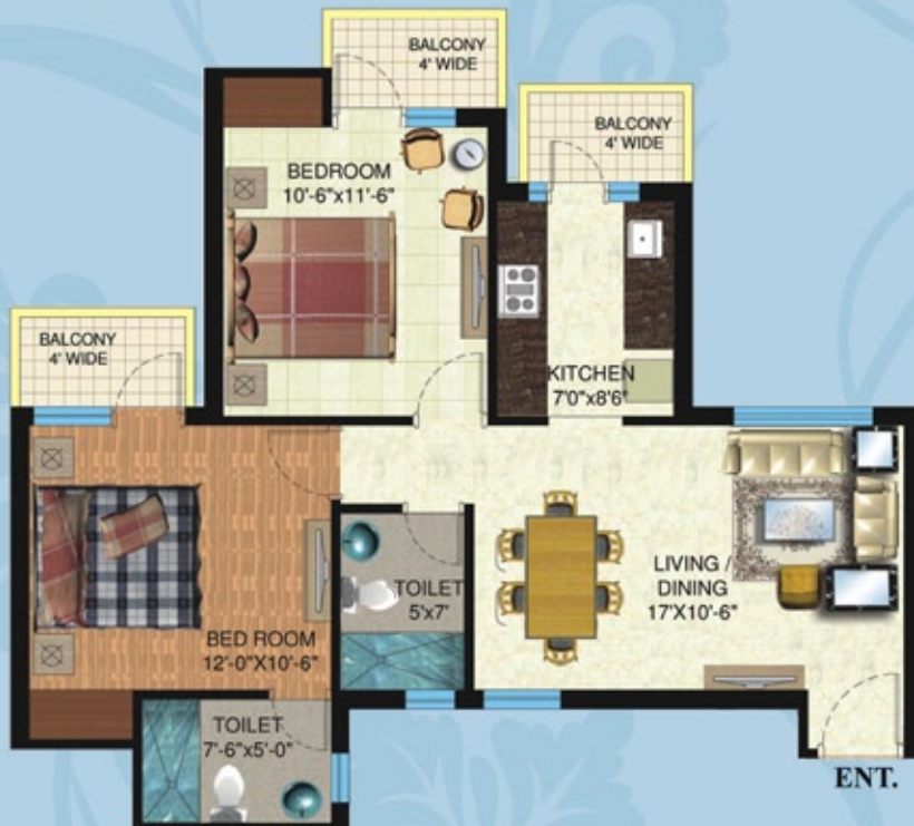
2 Bedroom Unit Plan Super Area - 1050 sq.ft.