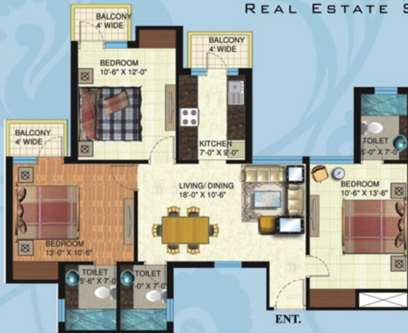
3 Bedroom Unit Plan Super Area - 1340 sq.ft.