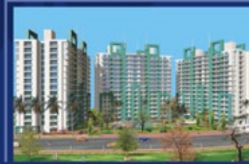
KRISHNA APRA SAPPHIRE Indirapuram, Ghaziabad