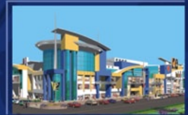
KRISHNA APRA DMALL Indirapuram, Ghaziabad