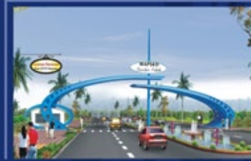
MAPSKO GARDEN ESTATE 150 Acres township Sector-26, 26-A, 27, Sonapat