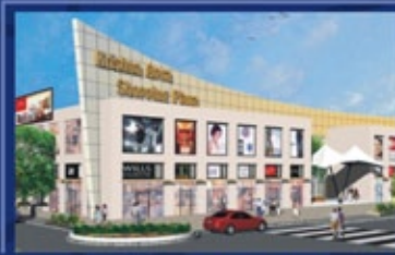
KRISHNA APRA SHOPPING PLAZA Indirapuram, Ghaziabad