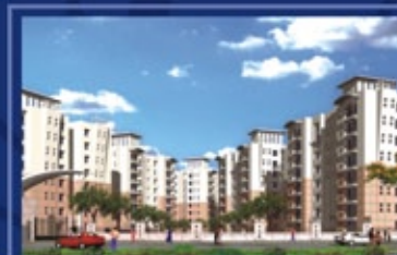
KRISHNA APRA RESIDENCY Noida