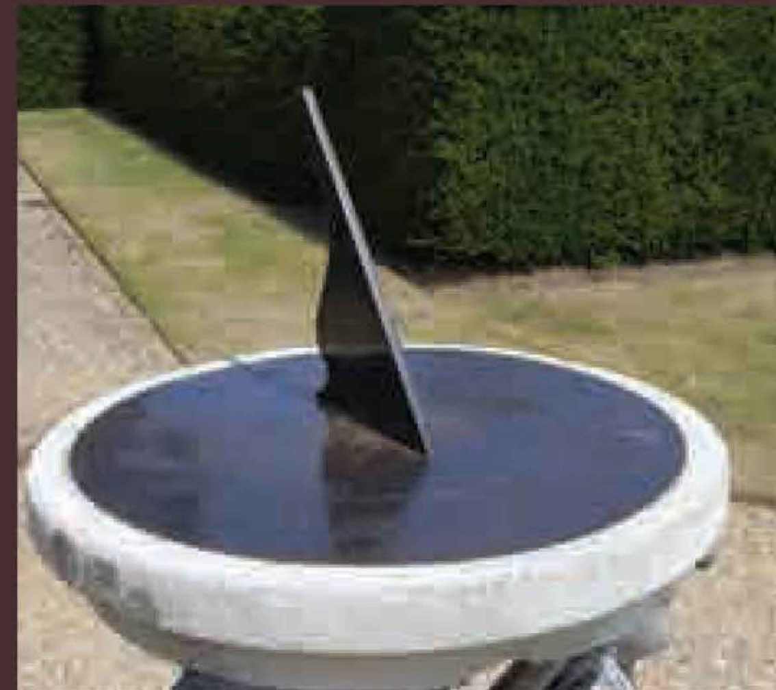
Sculptures integrated into the landscape