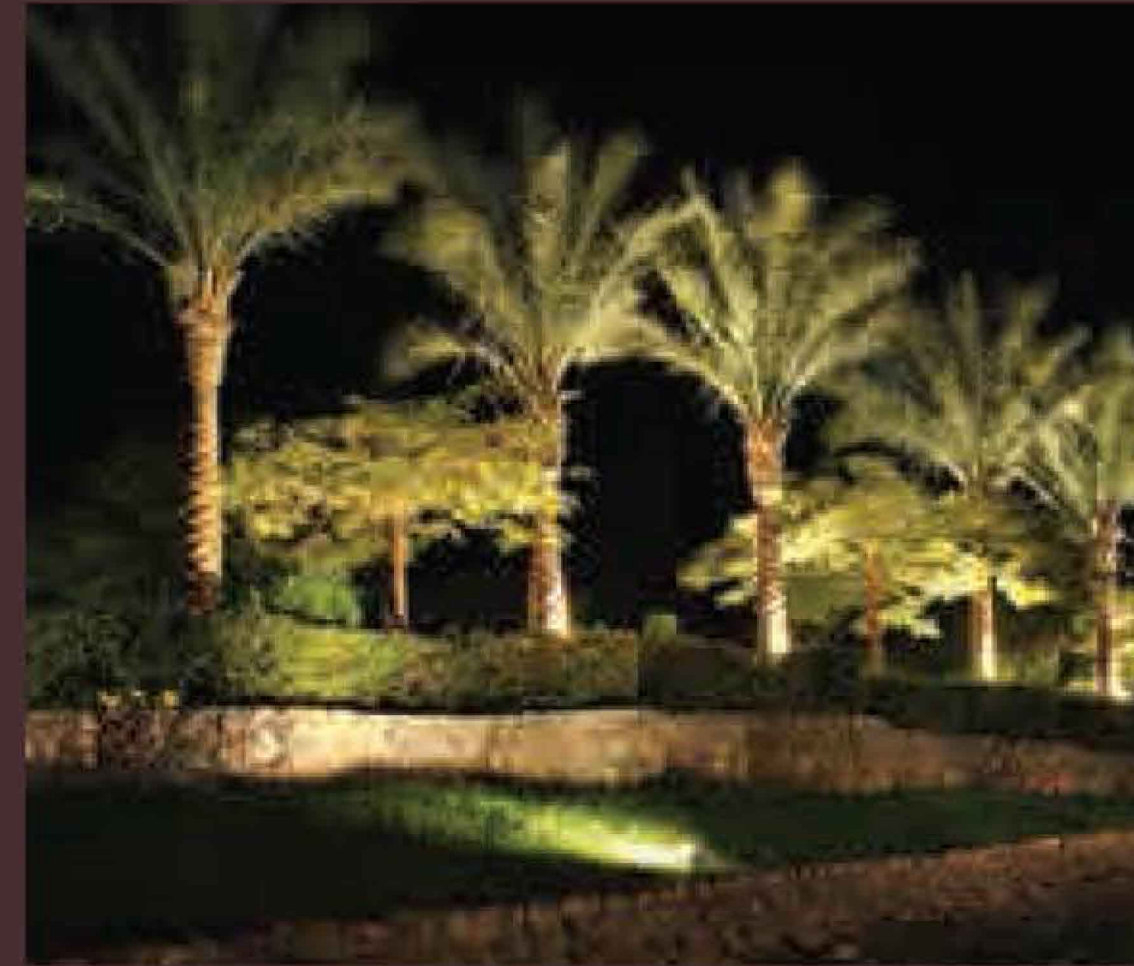
Palms with uplighters